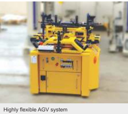
Highly flexible AGV system