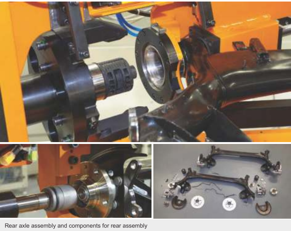
Rear axle assembly and components for rear assembly

The wide range of variants demands the highest possible level of flexibility.