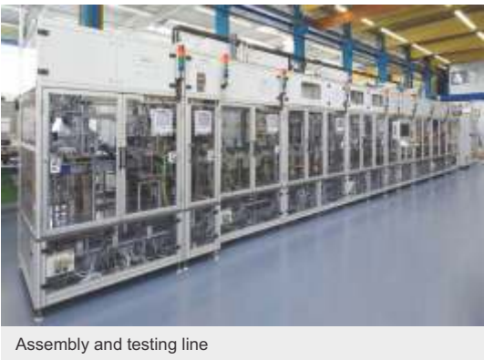
Assembly and testing line